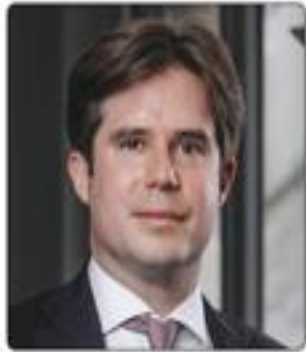
Felix Neri Schifferli & Associés, Geneva