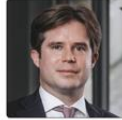
Felix Neri Schifferli & Associés, Geneva