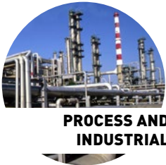
PROCESS AND INDUSTRIAL