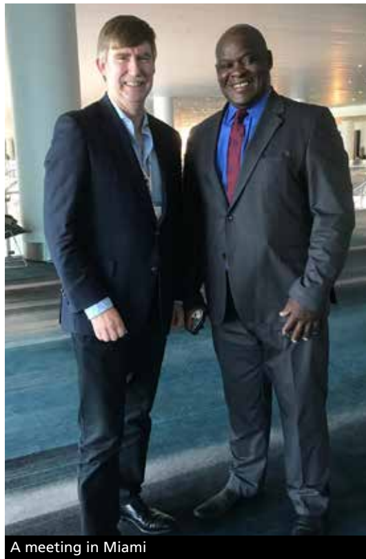
A meeting in Miami

At one stage he reached into his jacket pocket to check the flight time on his ticket. As he extracted