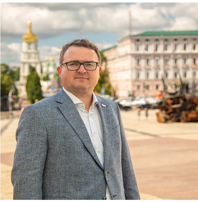
Anton Korynevych, Ambassador-at-large of the Ministry of Foreign Affairs of Ukraine.

The crime of aggression is one of the four core international crimes enshrined in the Rome Statute of the International Criminal Court (ICC). It is essentially a reinterpretation of the 'crimes against peace' concept first employed at Nuremberg and Tokyo, where dozens of suspects were convicted of the crime, including Hermann Göring and Rudolf Hess.