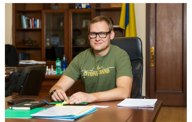
Andrii Smyrnov, Deputy Head of the Office of the President of Ukraine.

In March of last year, Ukraine's Office of the President and Ministry of Foreign Affairs began advocating the tribunal's creation. Several months later, the proposal was supported by the Parliamentary Assembly of the Council of Europe and by the European Parliament. Today, there are already numerous resolutions by the Parliamentary Assembly of the Council of Europe, the European Parliament, NATO's Parliamentary Assembly, and the Parliamentary Assembly of the Organization for Security and Co-operation in Europe. The Seimas of the Republic of Lithuania and the parliaments of Estonia, the Netherlands, the Czech Republic, France, Latvia, and Slovakia have also adopted resolutions supporting the establishment of a special tribunal for the crime of aggression.